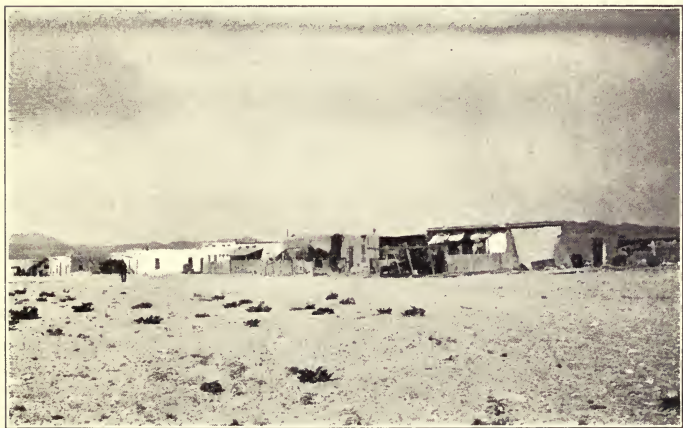
TYPICAL MEXICAN VILLAGE IN TEXAS